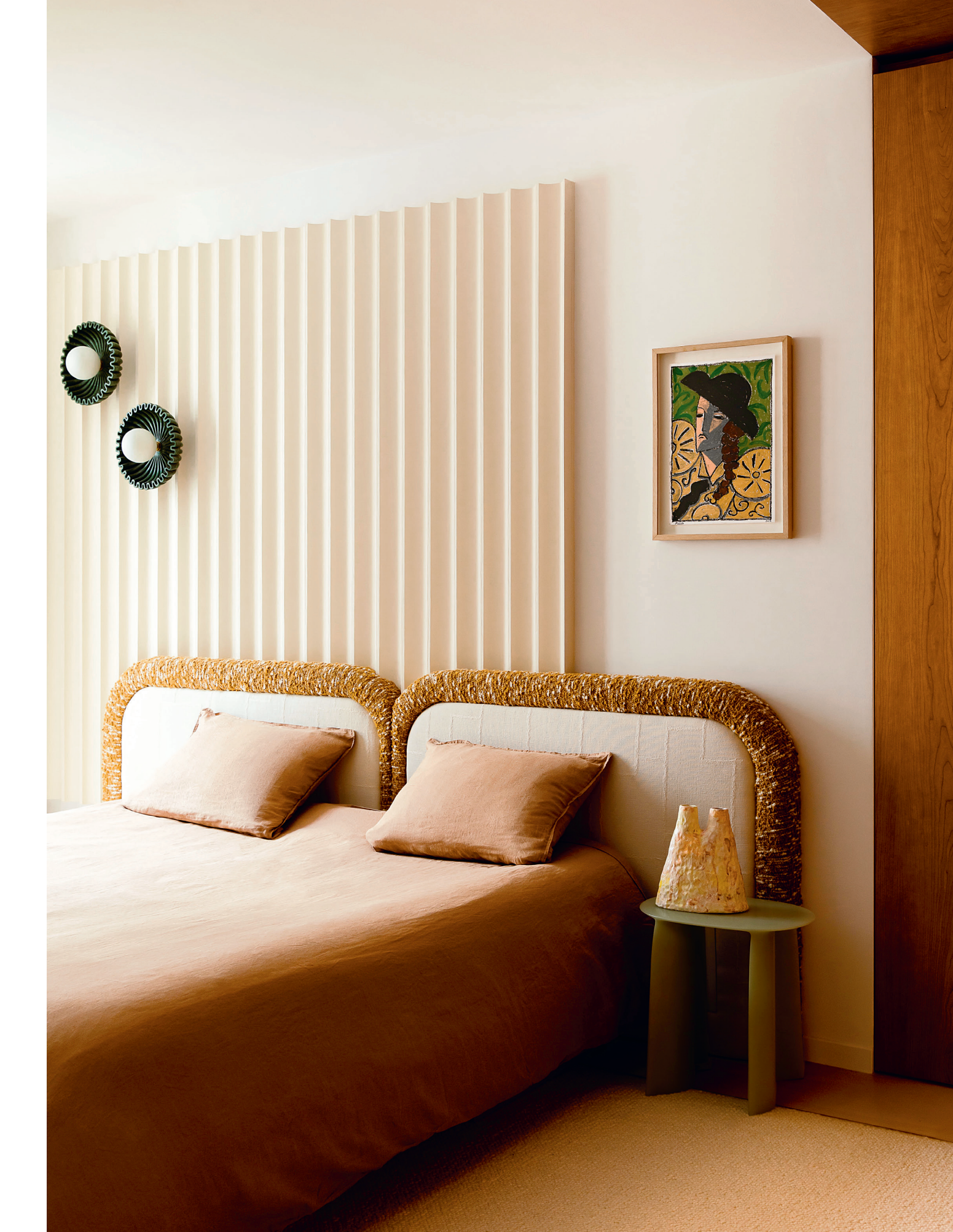
Facing page Fluted panelling and a pair of Ostro wall lights by Simone & Marcel offset the symmetry of the master bedroom