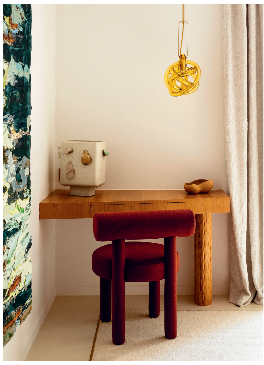
Above In the master bedroom, the vanity/desk area features a Gropius CS1 chair by young Ukrainian brand Noom